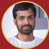
Mr Pullela Gopichand Sports & Fitness

Chief National Coach for Indian National Badminton Team and Feemer Indian Badminton Player.