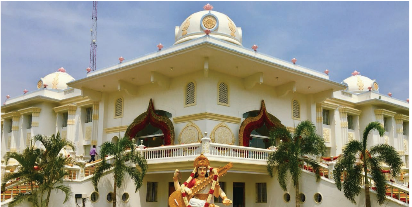
Sri Sathya Sai University for Human Excellence

With great joy, and a profound sense of gratification, the Sri Sathya Sai University for Human Excellence celebrated its 2nd convocation on the auspicious day of Guru Poornima. It was truly an occasion to celebrate as we witnessed the exceptional accomplishments of our students from rural India, the majority of whom embarked on their educational journey with us at the higher primary level, and went on to achieve remarkable success, earning their degrees with flying colours. This momentous occasion not only marked a significant milestone but also allowed us to reflect upon our incredible journey.