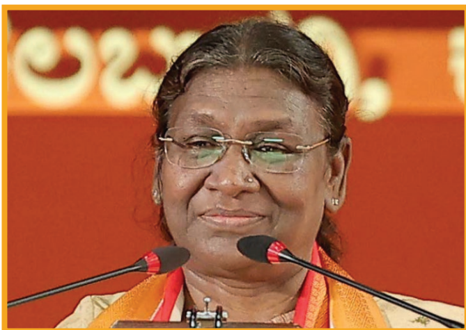
Smt. Droupadi Murmu Hon. President of India 2nd Convocation of SSSUHE July 3, 2023

The 2nd Convocation featured the conferment of Bachelor's and Master's degrees to 123 students (out of a total strength of nearly 400 university students in UG & PG) who completed their graduation / post-graduation in the academic year 2022-23. Honorary Doctorates were also awarded to five eminent citizens from different walks of life.